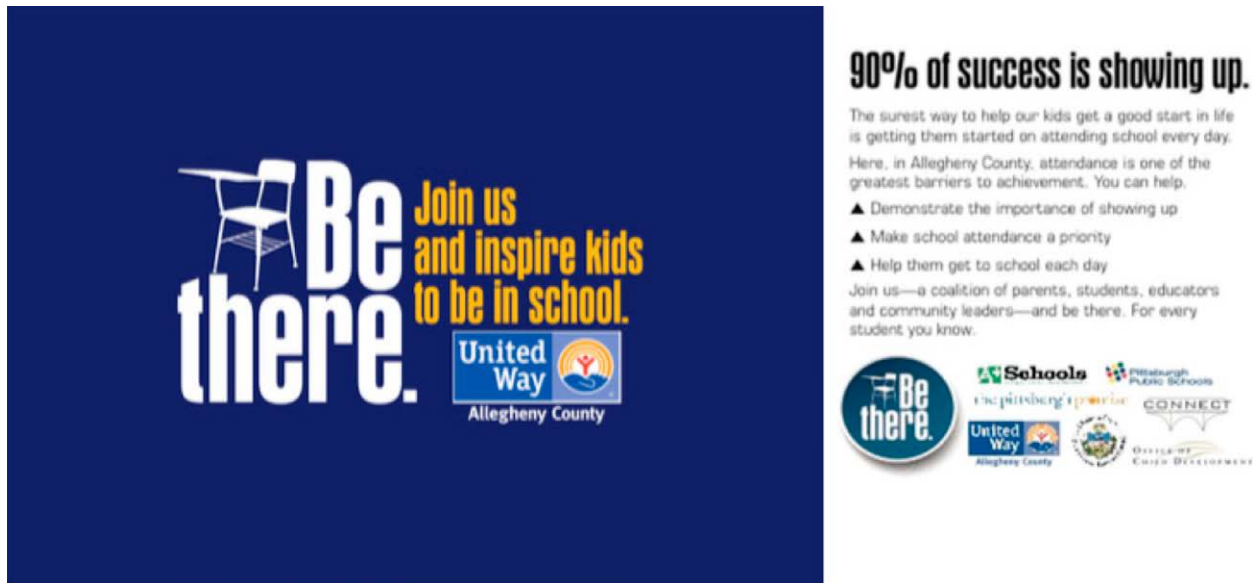
Figure 1. Be There Postcard